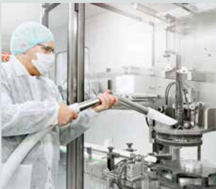
Available a specific set of accessories for clean-rooms