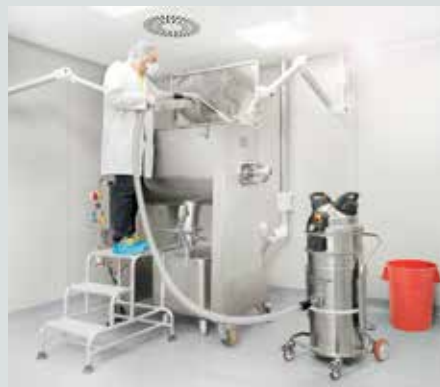
For wet and dry applications in cleanrooms