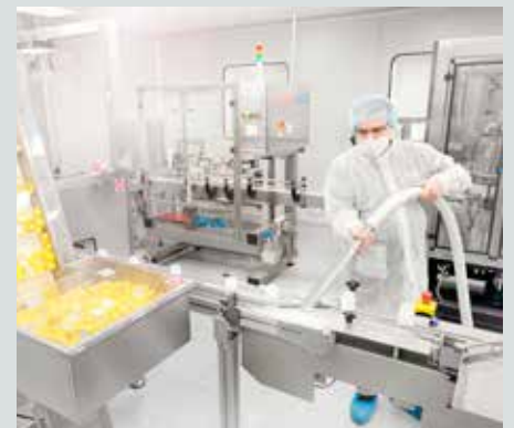
Recovery of dust in food supplements production