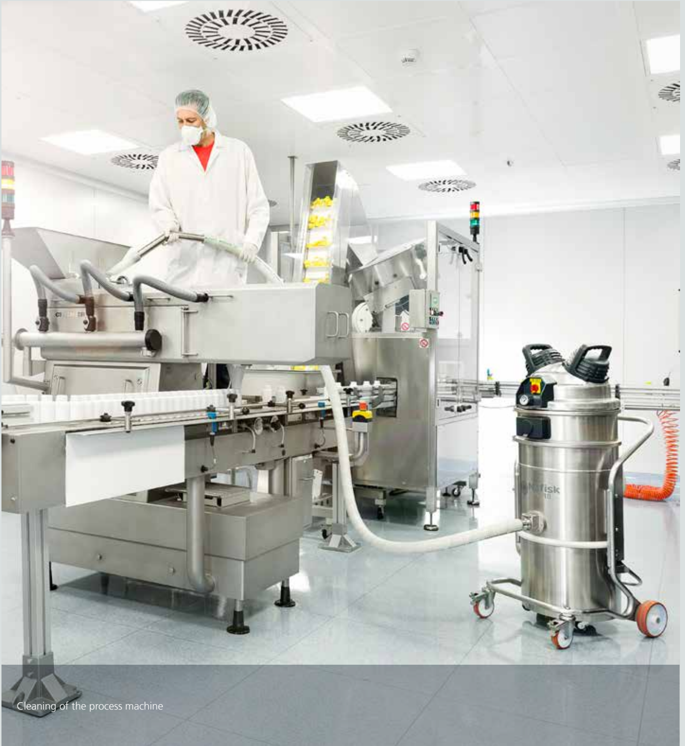
Cleaning of the process machine