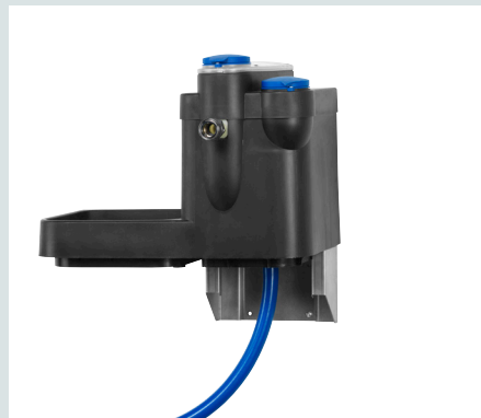
External Water Break Tank for up til 40 ltr/min.