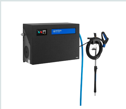
Accessory storage kit, for lances, hose, gun and foam sprayer