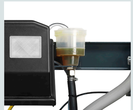
Pump oil tank with oil level sight and fill/empty function